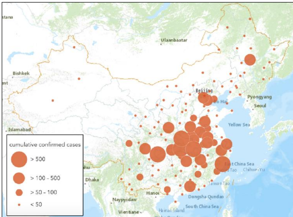
Figure 1. "Location of 120 cities and cumulative COVID-19 confirmed cases in each city as of 29 February 2020" [2]

A recent study on COVID-19 diffusion, conducted in China (Figure 1) in 120 cities (4 municipalities and 116 prefecture-level city), considered daily concentration of six air pollutants as PM_{2.5} , PM_{10} , SO_2 , NO_2 , O_3 and the meteorological conditions [2].