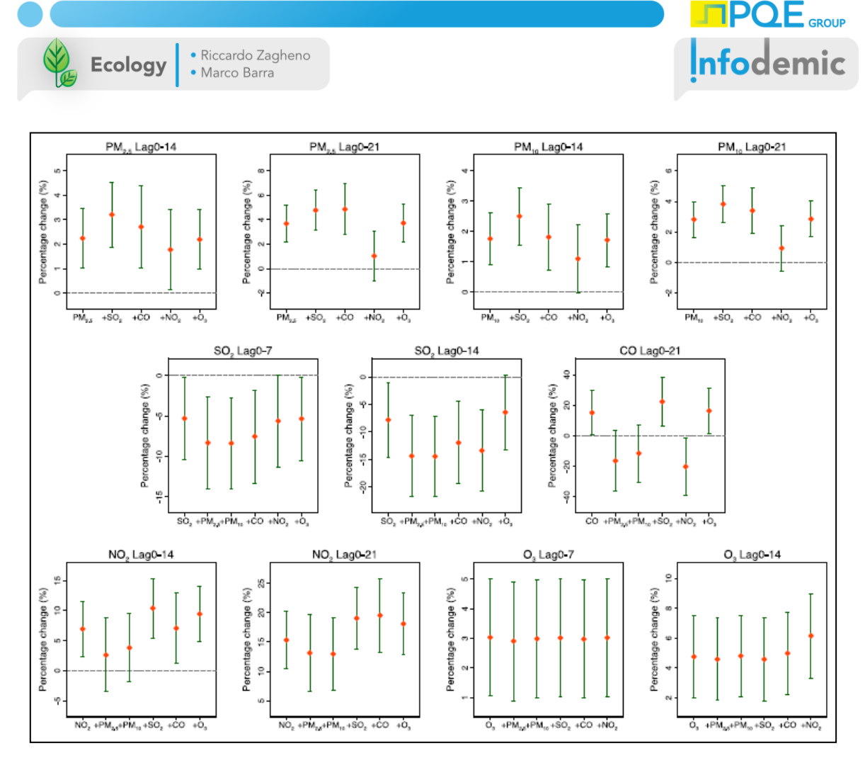
Figure 3 . "Percentage change (%) and 95% CI of daily COVID-19 confirmed cases associated with a unit increase in pollutant concentration using single and two-pollutant models. Units are 10 \mu g/m3 increase in PM<sub>2.5</sub>, PM<sub>10</sub>, SO<sub>2</sub>, NO<sub>2</sub>, O<sub>3</sub> and 1 mg/m<sup>3</sup> in CO" [2]

Authors observed significantly positive associations with short-term exposure to high concentrations of PM<sub>2.5</sub>, PM<sub>10</sub>, CO, NO<sub>2</sub>, O<sub>3</sub> with COVID-19 confirmed cases. A short-term exposure to higher concentrations of SO<sub>2</sub> results to have a negative correlation with the number of daily confirmed cases. This approach, based on the relationship with pollutants air concentrations and daily confirmed cases of COVID-19, give a first positive response to the possible connection between concentration of air pollutants in China and confirmed cases of COVID-19 [2].